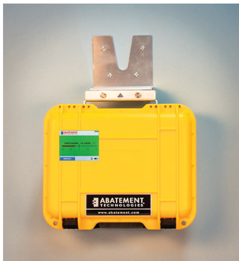
Wall Hanger (RPM-HANG) attaches to the rear of the PPM3-S case and a wall for secure mounting. P/N RPM-HANG sold separately.