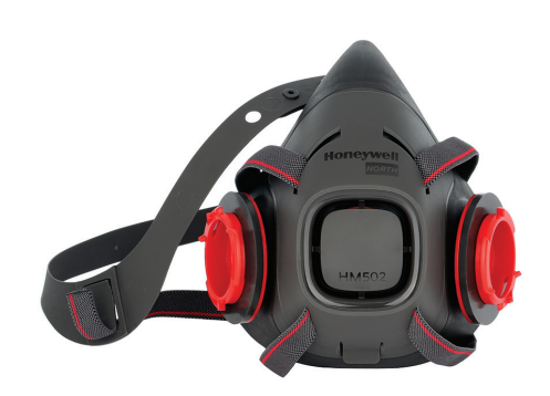
HM502, drop-down version