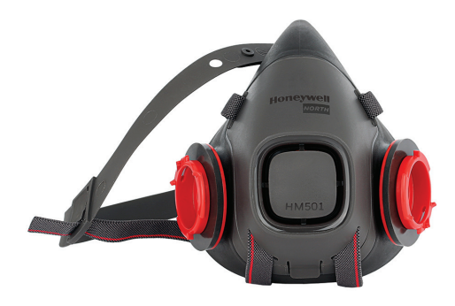
HM501, non-drop-down version