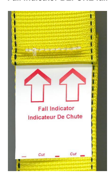
Fall indicator BEFORE fall