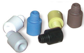
Metering Tips Part #NA0816A