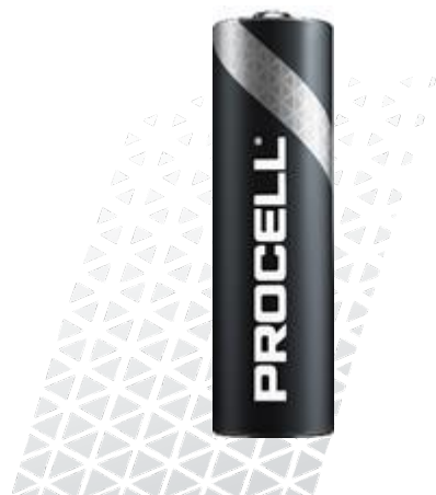
Size: AA (LR6) PC1500