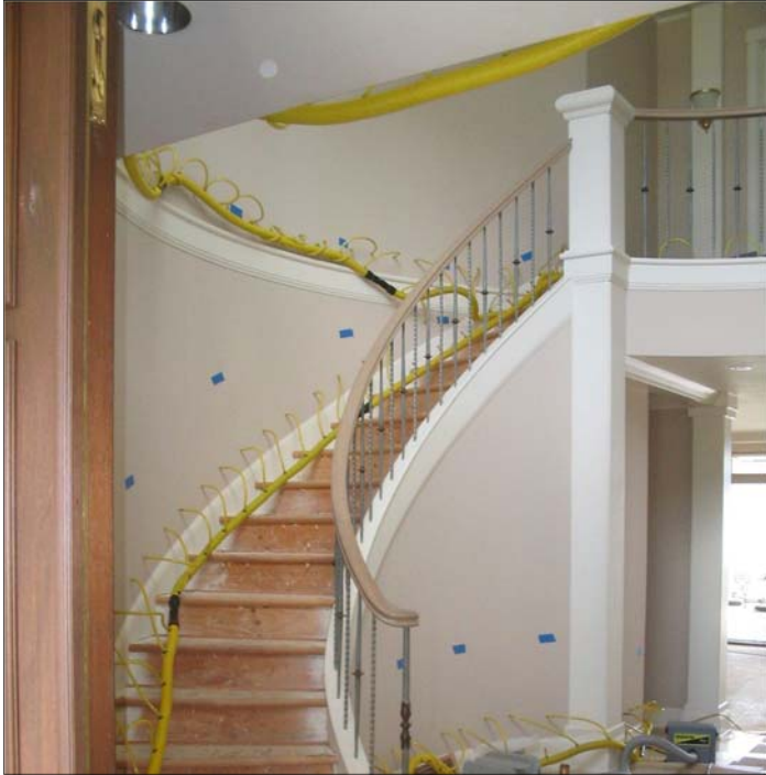
Ceiling and wall dryouts with patented Active Hoseline (tubing can be cut to the length needed for the job)