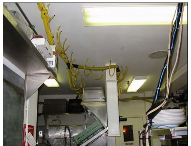
Wall drying behind tile